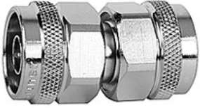
Fig. may differ