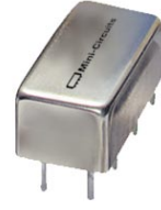
CASE STYLE: A01

Level 23 (LO Power +23 dBm) 0.07 to 200 MHz